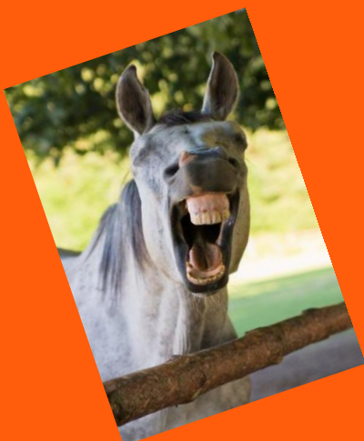
STRAIGHT FROM THE HORSE'S MOUTH