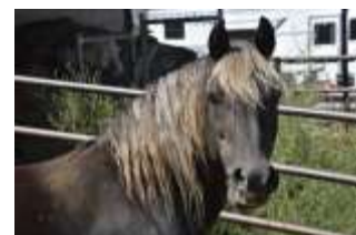
Schaenzers Silver Eagle Silver Dapple Stallion for sale