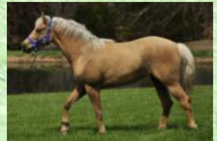
Sky Lindy Gold to Knight