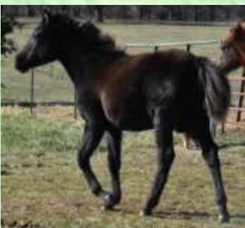
Missouris Peace Train By Knight