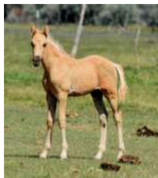
2017 colt by Rio