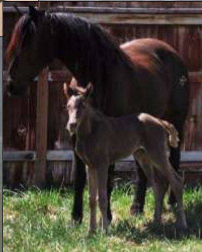
Silvershoe Shyanne Casper for 2018