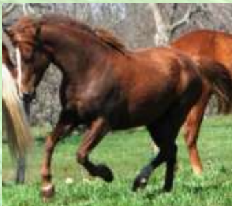
Missouris Silver Lynne to Knight