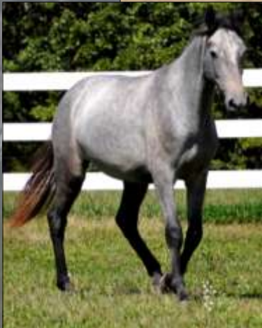
Missouris Silver Belle man for 2018