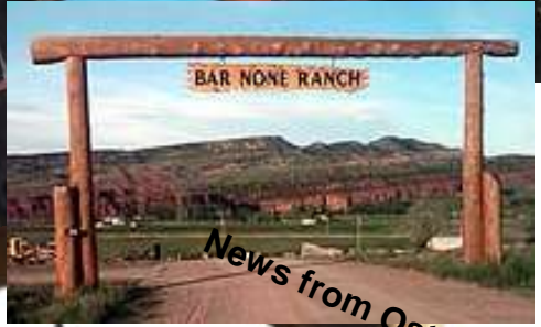
News from Ostara Morgans: