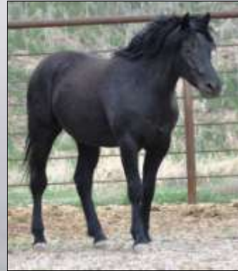
Mtn Edge Black Boaz stallion

Super Gaited Colt for sale, Mtn Edge Silverstorm by Lone Peak Tiarra