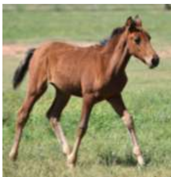
2017 colt on Shadowflax