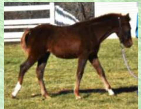
Chief ...purebred unregistered gaited morgan colt