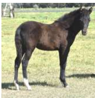
2017 filly by Shadowflax

2017 colorful gaited fillies and colts for sale. Easy prices and plenty of gait. 2018 foals by KTM Shadow Hawk, Gaited Morgan Silver Dapple Stallion, 2 mares in foal to KTM Tequila Rio Palomino Gaited Morgan stallion