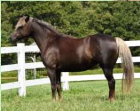
Missouris MOJO Image to Knight