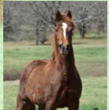
R'Surene Hypatia to Knight