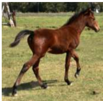
2017 filly by Shadowflax