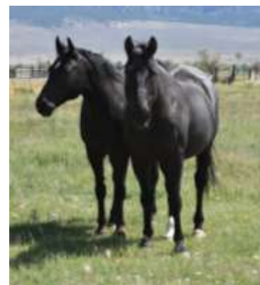
Driving pair well trained for sale

Ken Thomas, 650 E 1070 N. , Richfield, UT. 84701