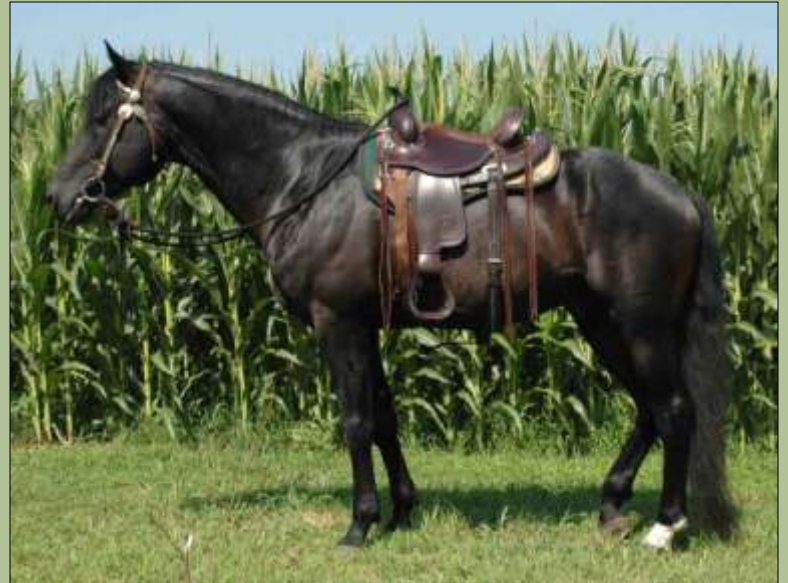
Stallion at stud Bucksnots Silver Ea- gle