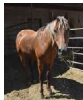
KTM Silver Dollar, Silver Dapple Gelding ready to train