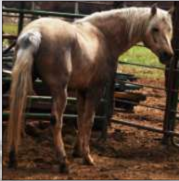
Sky Casper Gold Stallion