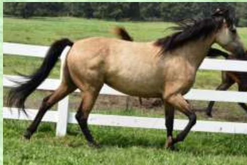
KTM Buttercup to KTM Shadow Hawk