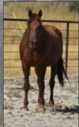
Trailhead Ruby in foal to per for 2018