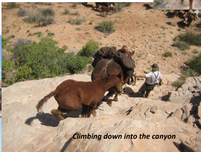
Climbing down into the canyon