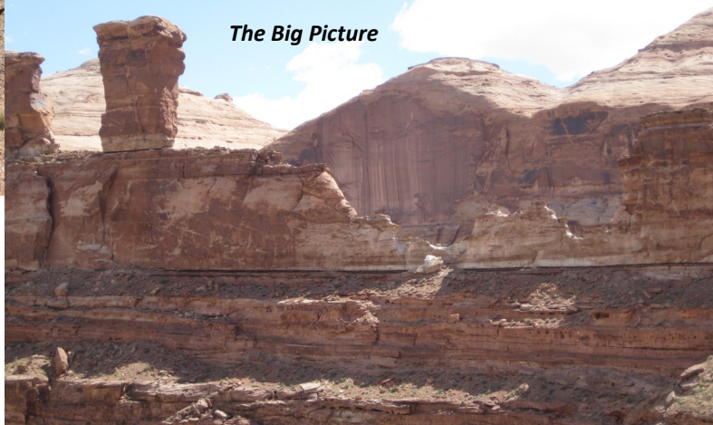
The Big Picture

Editors Note: You really can't appreciate the depth and vastness of this country in these photos. I will be posting these on the MSFHA website at www.gatedmorgans.org so you can enlarge the image to see more detail. What a ride!